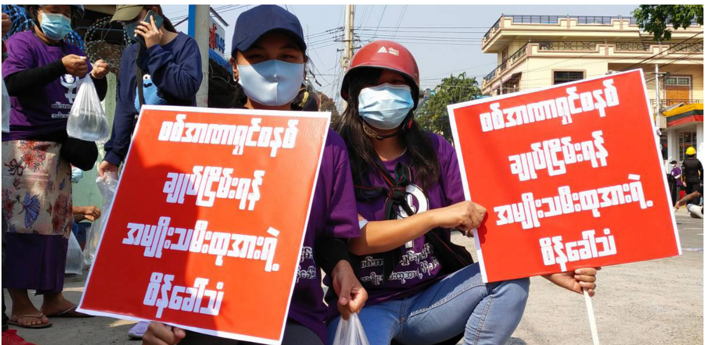
CDM protest Lashio, Shan State. March 2021.